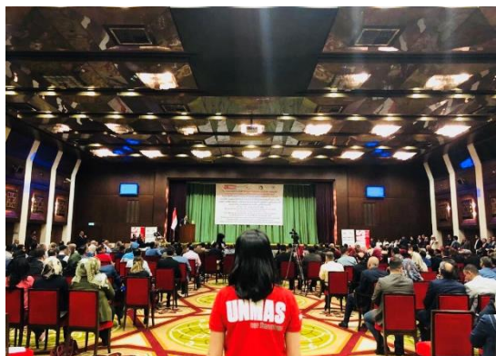
Photo: Commemorative ceremony in Baghdad

UNMAS celebrated the International Day for Mine Awareness and Assistance in Mine Action with the Directorate of Mine Action (DMA) in Baghdad and the Iraqi Kurdistan Mine Action Agency (IKMAA) in Erbil. Various activities were on the agenda of the two events respectively led by DMA and IKMAA, including speeches by relevant ministries, DMA, IKMAA and UN representatives, a photo exhibition, screening of videos, school activities and booths at the Baghdad Book Fair showcasing risk education material.