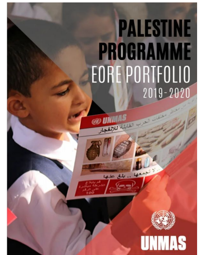
Front cover of UNMAS Palestine Programme EORE Portfolio

https://unmas.org/sites/default/files/palestine_programme_eore_portfolio_2019-2020.pdf