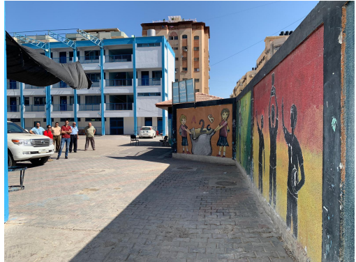
Al Bahrain Boys School

After a suspicious object was found by security staff at the Al Bahrain Elementary Boys School in Gaza City, UNMAS was requested by UNRWA to perform a risk assessment and clearance. The school which caters to 990 boys between the ages of 8 and 12, in addition 32 UNRWA staff had been immediately evacuated.