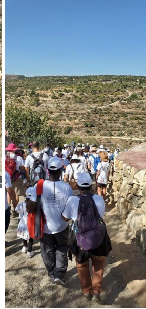
UNMAS and PMAC at a walk in the West Bank for UNICEF CRC@30.

UNMAS and Palestinian Mine Action Center (PMAC) participated in a walk in the Massar Ibrahim trail in the West Bank, organized by UNICEF highlighting children's Right to Play, as part of a month long celebration of the 30 th anniversary of the Convention of the Right of the Child.