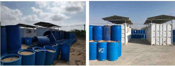
Temporary Explosive Storage Facility before and after renovations.

In 2018 UNMAS constructed a temporary explosive storage facility in Gaza for the protection of civilians from the risk from ERW. Prior to the building of this temporary storage facility, ERW were kept in the middle of the city prior to destruction, adjacent to schools and residential building posing a threat to all in the surrounding areas. Recently UNMAS implemented physical safety and access improvements, reducing the risks to both civilians and UNRWA staff working at the nearby UNRWA logistics base in Rafah. These measures included the refurbishment of the blast mitigation walls and the laying of an interlock roadway to improve access to the site.