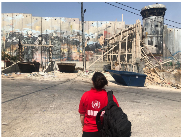
UNMAS at site visit to Aida Refugee Camp in Bethlehem, West Bank.

UNMAS is working with MSB (Swedish Civil Contingencies Agency) to develop and deliver risk education sessions aimed at helping residents of refugee camps to identify ways to reduce the risks from the use of chemical irritants (CI), such as tear gas, in the West Bank. The risk education sessions will be divided into identifying chemical and explosive risks, coping mechanisms and emergency first aid training.