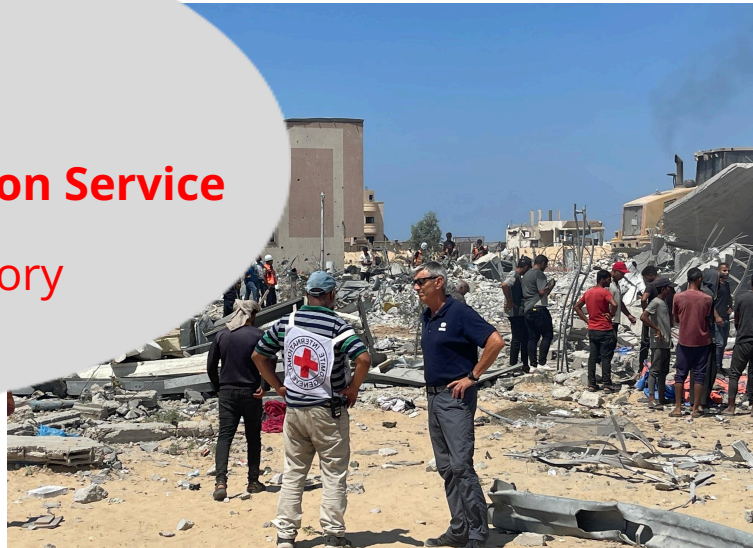
[UNMAS EOD team escorting an interagency mission to rescue people trapped under rubble in Hamad City, Khan Younis, Gaza Strip, August, 2024]