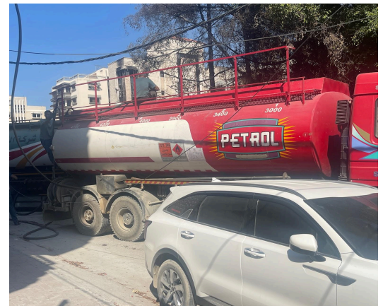
[UNMAS EOD team conducting EHA for an UNRWA convoy route towards Gaza and North Area for the delivery of fuel at UN building and UNRWA Gaza Field Office, August, 2024]

To increase the flow of humanitarian assistance, our EOD Officers support interagency missions by conducting route EHAs along roads that help actors deliver humanitarian assistance to vulnerable communities. In August, the team supported 18 interagency missions that delivered 4 food trucks consisting of 104 pallets, 1 fuel truck delivered 20,000 liters of fuel and supported the collection of 8 armored vehicles for humanitarian operations. UNMAS also supported the rotation of humanitarian personnel from and into Gaza, assessment of security facilities, and assessment of civilians' access to humanitarian activities. Without the assistance of UNMAS EOD Officers, these UN convoys would not be able to move through these very high risk areas.