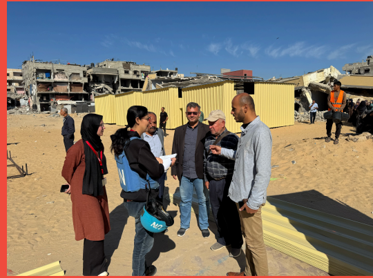
UNMAS Liaison Officer speaks to community leaders about the EHA for the Temporary Learning Space intended to serve 3,000 children in Khan Younis. 17 November 2024

On 17 November, EOD Officers received a request from local community members to carry out an EHA of a school playground that had been hit by munitions in February 2024. The community explained that they intend to use the site as a Temporary Learning Space for around 3,000 children to address the fact that there are no available or functioning schools in the area.