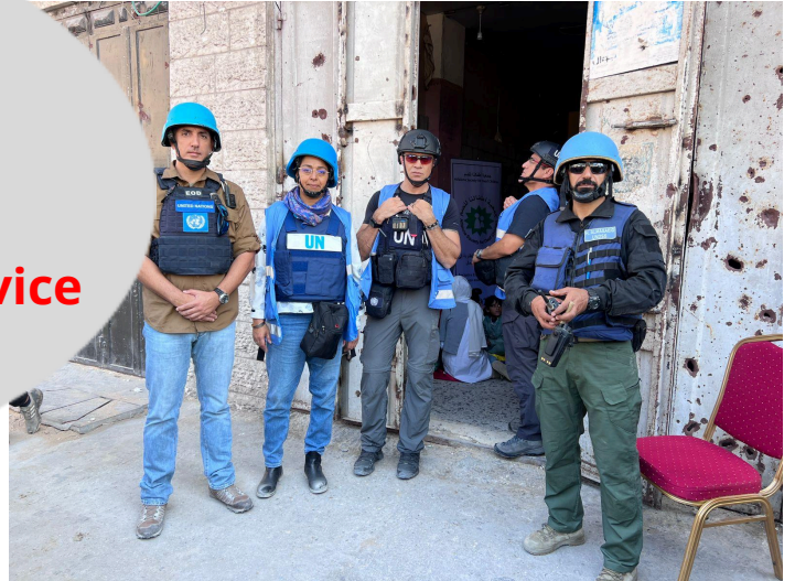
EOD Team Lead accompanies an interagency mission to northern Gaza for the Humanitarian Coordinator's visit on 5 November 2024