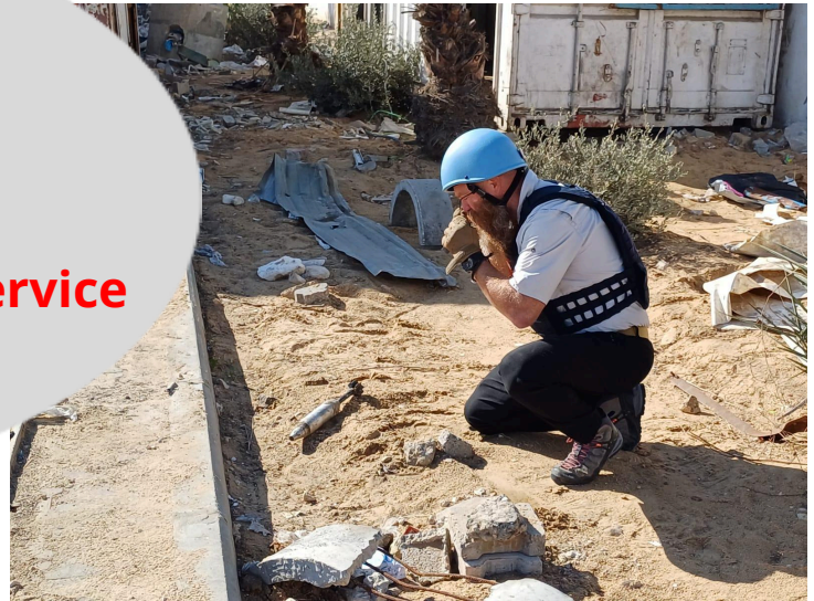
UNMAS EOD Officer conducting an assessment of explosive ordnance found in the Khan Youni Training Centre, Gaza. 30 Dec 2024