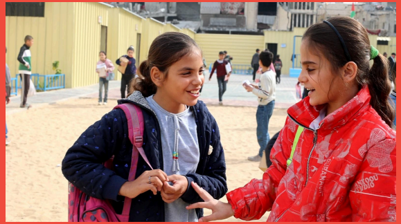
Children attend educational sessions at a Temporary Learning space built on an old children's playground. UNMAS conducted an EHA of the site in November to ensure the space could be built on and used safely. Khan Younis, Gaza, 11 Dec 2024.

■ IDP Camp/Shelter ■ UN Facilities ■ Access/Roads