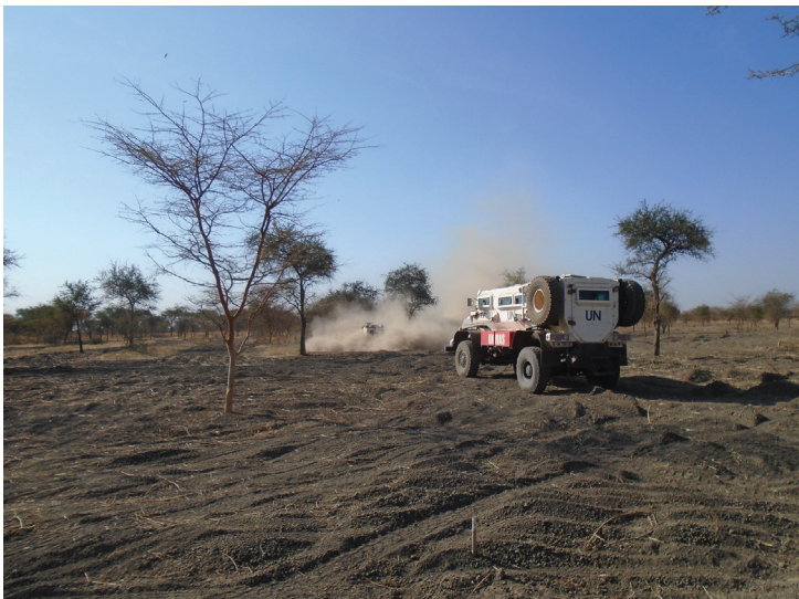
Manual Clearance with the MW240

UNMAS continues to provide regular destruction of confiscated weapons and ammunition at the Weapon and Ammunition Management facility.