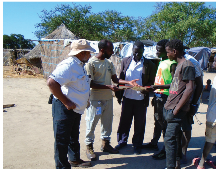
Non- Technical Survey in Rumamier