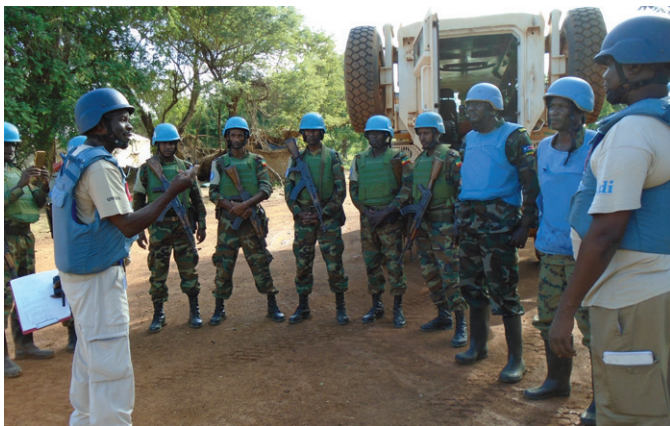
PST and mine-protected vehicle on a Ground Monitoring Mission