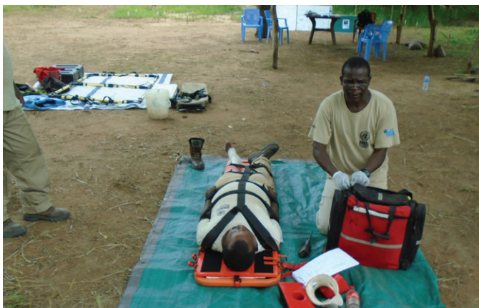
Teams conducting CASEVAC exercises as part of refresher training

The rainy season continued in the region, limiting movement and activities in the Abyei area and the Safe Demilitarised Border Zone (SDBZ).