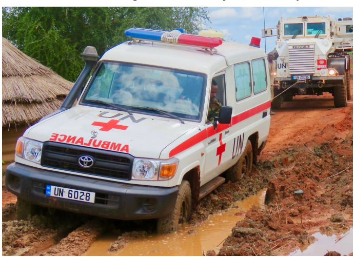
UNMAS Casspir vehicle coming to the rescue of a UN ambulance

The UNMAS Integrated Road Assessment and Clearance Teams (IRACT) remobilized by the end of September, after the rainy season stand down period.