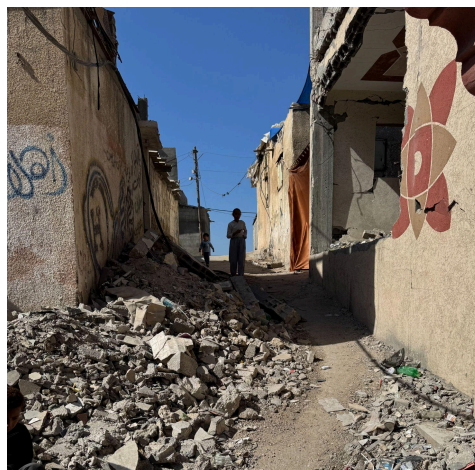
EHA as part of UNDP Debris Management Pilot Project, conducted on 26 October 2024 in Dair Al Balah

UNMAS takes this opportunity to thank all of its donors for their invaluable contributions to humanitarian mine action, without which UNMAS would not be able to continue its lifesaving activities in oPt.