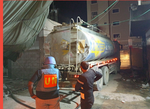
UNMAS EOD Officer provides support to IAM delivering fuel and medical supplies to Kamal Adwan hospital in northern Gaza on 24 October 2024

In late October, UNMAS facilitated an interagency mission with UN and humanitarian partners to evacuate critically ill patients from Kamal Adwan hospital to Al Shifaa hospital in Gaza City and to supply Kamal Adwan hospital with fuel, blood, medical supplies and dry food.