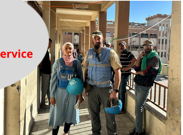
EOD Officer and Liaison Officer conduct an EHA of two schools in Khan Younis, Gaza, hosting 1,300 IDPs. 25 October 2024.