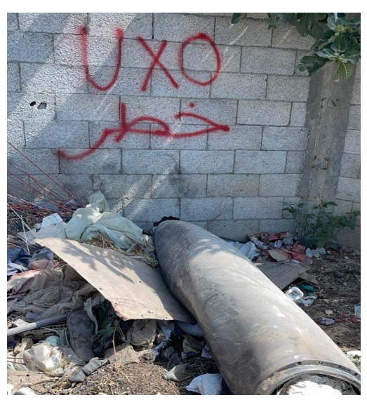
[Unexploded ADW discovered during an EHA conducted by L in Deir Al Balah (Middle area / Gaza Strip), 20 June 2024.

In June, our EOD Officers conducted seven EHAs across the Gaza Strip for five internally displaced persons (IDPs) shelters, one health center and one historical site. The EHAs allowed humanitarian operations and civil activities to continue safely, free from the explosive hazards. One of the EHAs was done for a 500 square meter area occupied by two IDP families that had been previously hit by the Israeli Air Forces (IAF), leaving an unexploded bomb. The UNMAS FOD team confirmed the bomb was non-functional, marked the area with visible warning signs to alert civilians explosive threat, recommended the bomb be removed and destroyed safely as soon as