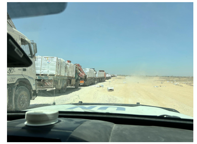
[UNMAS supporting a humanitarian assistance delivery convoy @UNMAS]

UNMAS oPt is again appealing to donors from the third quarter of 2024 to continue supporting its work as it reaches a critical stage in emergency response and preparedness for ceasefire and postwar recovery efforts. Invitations to provide further information about its work and needs in the