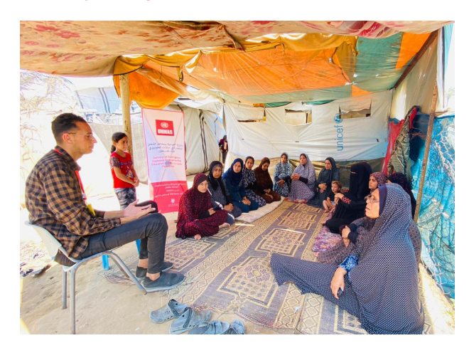
[Save Youth Future Society (SYF), UNMAS' local implementing partner, delivering an EORE formal session for women in an internally displaced persons (IDP) camp in Deir Al Balah, Middle Area, Gaza Strip, June 2024 ]

UNMAS continues its efforts to enhance community awareness on the threat of explosive ordnance to spare lives and support security. UNMAS contracted a local implementing partner, Save Youth Future Society (SYF), to deliver EORE to the local communities, with focus on the internally displaced persons (IDPs). To ensure as wide, fast and effective messaging as possible, SYF teams conduct formal EORE sessions in Rafah, Khan Younis, and Deir Al Balah at UNRWA's designated emergency shelters (DESs), IDP camps, random sheltering places, and others. The SYF also carries out street visits across different areas to share risk messages with pedestrians and civilians' gatherings. During June, the SYF delivered EORE awareness messages to a total of 48,122 civilians including 12,685 men, 13,113 women, 10,778 boys