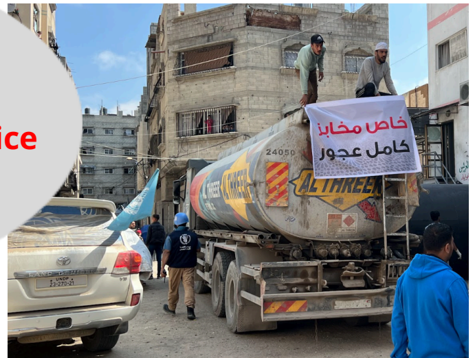
[Photo caption: UNMAS EOD Officer supports interagency mission to resupply a bakery with fuel]