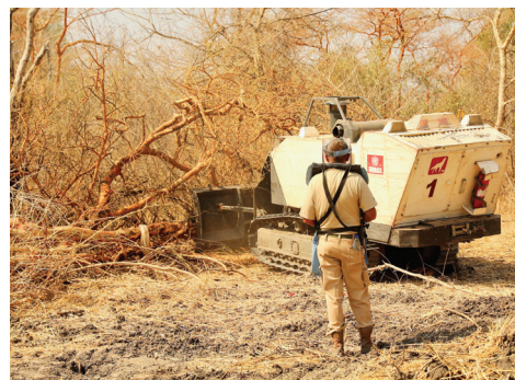
Various clearance activities