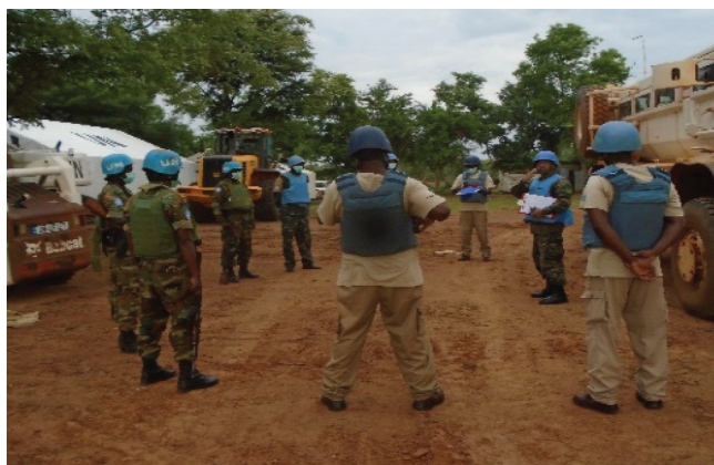
Social distancing imposed by UNMAS teams during briefings

Each morning before embarking on the patrol, all members have their temperature checked by the UNMAS PST medic, as a means of containing the spread of the virus. If any patrol team members show a high temperature or flu-like symptoms, they are not allowed to go on the patrol. All members have their hands sanitized when boarding the vehicles, not only at the start of the patrol, but also whenever the team stops during the patrol. It is also mandatory that all members wear face masks at all times during the patrol. Before each patrol, the UNMAS PST medic briefs the patrol members on the COVID-19 pandemic mitigation measures and necessary actions for reducing the spread of the virus.