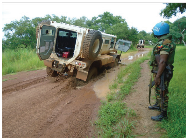
Road conditions during the rainy season poses a major challenge to conducting GMMs