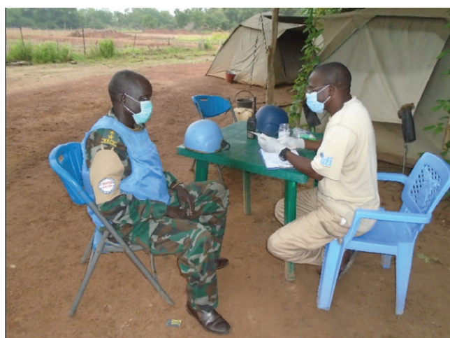
UNMAS team medic checking temperature of each patrol member prior to embarking on a patrol

GMMs at TS 11 in Kiir Adem, JBVMM Sector 1 resumed on 27 July 2020 after a three months suspension due to the outbreak of the pandemic. During the month of August 2020, the team conducted seven GMMs. The rain was not the only challenge presented to the team, as the COVID-19 outbreak has seen new measures being implemented to limit the spread of the disease to the patrol team members. The patrol strength has been reduced to accommodate less members in response to WHO requirements, such as social distancing. Additionally, the CASSPIR MPVs are also disinfected before and after each patrol outing.