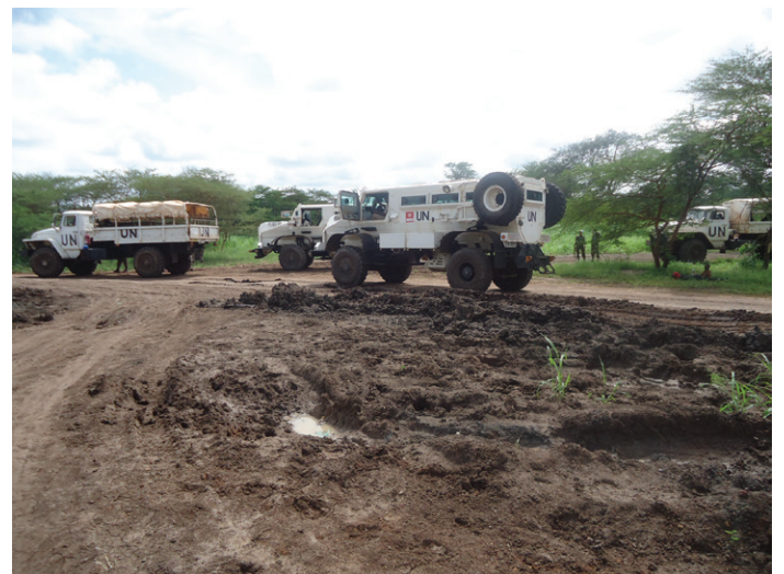
Difficult road conditions throughout the Abyei area require extended driving skills for MPV drivers