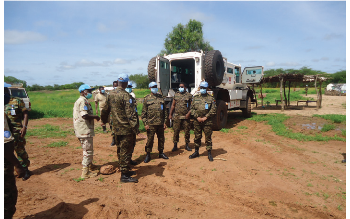
UNISFA delegation & UNMAS team members after disembarking the MPV near Diffra

Mine action entails more than removing landmines from the ground. In addition to the regular mine action activities, UNMAS teams enhance the safety and security of peacekeepers through a variety of additional actions, including the disposal of weapons and ammunition confiscated by UNISFA troops, delivering risk education to UNISFA personnel to enhance their knowledge of safety practices, and deployment with the JBVMM teams to conduct safer ground patrols in the Safe Demilitarized Border Zone.