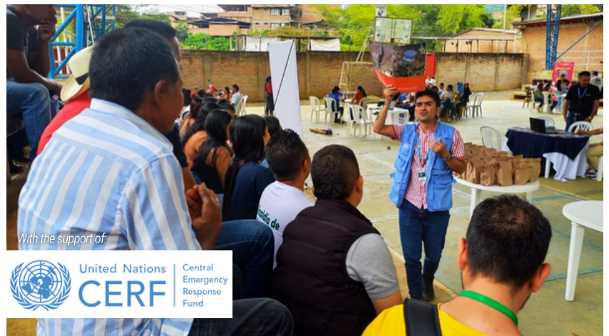
The mine action Humanitarian Coordinators will work to support the fulfillment of the Humanitarian Response Plan (HRP) defined annually by the mine action organizations that are part of the Mine Action Area of Responsibility in Colombia.

The United Nations Central Emergency Response Fund (CERF) approved the disbursement of US$6.5 million to finance various projects to be implemented by eight UN system offices in Colombia starting in June of this year, in areas such as food security, child protection and mine action (MA).