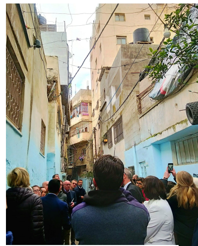
UNMAS visit to the Shaufat Refugee Camp, as part of the East Jerusalem TaskForce.

UNMAS also partnered with War Child Holland and MMDM France to disseminate integrated EORE and COVID-19 awareness material in the northern Jordan Valley.