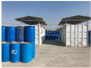
Temporary Explosive Storage Facility before and after renovations.

In 2018 UNMAS constructed a temporary explosive storage facility in Gaza for the protection of civilians from the risk from ERW. Prior to the building of this temporary storage facility, ERW were kept in the middle of the city prior to destruction, adjacent to schools and residential building posing a threat to all in the surrounding areas. Recently UNMAS implemented physical safety and access improvements, reducing the risks to both civilians and UNRWA staff working at the nearby UNRWA logistics base in Rafah. These measures included the refurbishment of the blast mitigation walls and the laying of an interlock roadway to improve access to the site.