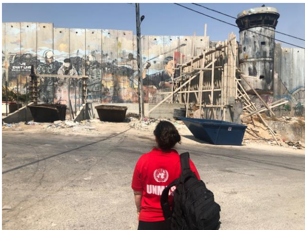
UNMAS at site visit to Aida Refugee Camp in Bethlehem, West Bank.

UNMAS is working with MSB (Swedish Civil Contingencies Agency) to develop and deliver risk education sessions aimed at helping residents of refugee camps to identify ways to reduce the risks from the use of chemical irritants (CI), such as tear gas, in the West Bank. The risk education sessions will be divided into identifying chemical and explosive risks, coping mechanisms and emergency first aid training.