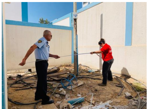
Al Bahrain Boys School

After a suspicious object was found by security staff at the Al Bahrain Elementary Boys School in Gaza City, UNMAS was requested by UNRWA to perform a risk assessment and clearance. The school which caters to 990 boys between the ages of 8 and 12, in addition 32 UNRWA staff had been immediately evacuated.